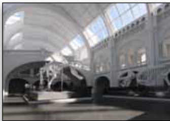
Visualizing project designs

MicroStation V8i's new geo-coordination capabilities enable project teams to accurately and quickly coordinate project information from multiple sources, stored in multiple file formats, using multiple coordinate and grid systems. Using MicroStation V8i geo-coordination tools, project teams can easily and accurately attach vector and raster reference data inside the same file. MicroStation V8i includes OGC Web Map Server support and concurrently integrates real-time GPS information inside the same MicroStation design environment.