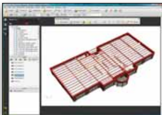
Produce intelligent 3D PDFs

MicroStation V8i's dynamic views help project teams simplify 2D drawing composition and enhance 3D modeling and visualization experiences. With dynamic views users can slice and filter models to see only what is needed and maintain a fully coordinated set of 3D models and 2D deliverables across projects. Because the views in MicroStation V8i are "dynamic," they are all updated immediately when the model is changed. Dynamic Views are optimized for both centralized and distributed teams to interactively compose 2D drawing sheets from plans, sections, and elevations.