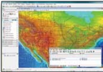
Geo-Coordinate project information

MicroStation V8i provides project teams with a single software product which delivers significant interoperability advantages. MicroStation V8i enables users to overcome many DWG reuse challenges and extend the value of DWG data by integrating all DWG and DGN content in one place. Users can aggregate and reuse 3D models from multiple software products, and work much faster with large raster files to speed project completion.