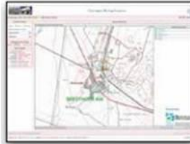
Easily integrate data from multiple sources into a single web interface.

What do SLAC, Oak Ridge National Library, Connecticut DOT, HGC (Hong Kong), the London Olympics, and the London CrossRail Project all have in common? They all use Bentley ProjectWise Geo Web Publisher to pull together data from sources like GIS and CAD to create websites that are easy to access to find directions, know what is happening on a construction project and more. Here is the way it works: Geo Web Publisher grabs data from ProjectWise or other data sources like Oracle Spatial, ESRI, or MicroStation or AutoCAD repository and then produces from that a website in layers, so data can be quickly displayed in lesser or greater detail depending on the requirement. For a really good example take a look at what Connecticut DOT has created on their public website .