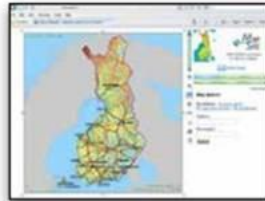
Create powerful and compelling public websites that are easy to navigate.