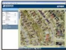
Publish geospatial data securely and quickly via a Web browser.