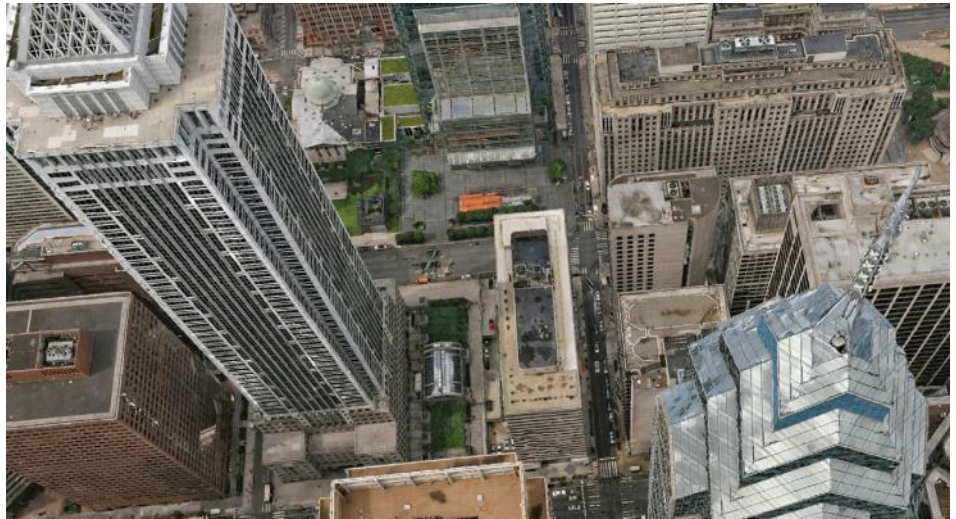
Part of the Philadelphia skyline modeled in ContextCapture by AEROMETREX ahead of the Pope's visit.

So what is it and what can I do with it? To use ContextCapture, you